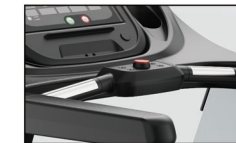
A-Zone controls allow runners make quick and easy choices