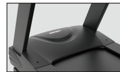
Powerful & Stable Drive System