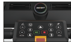
Smart Interaction & Remote Upgrades