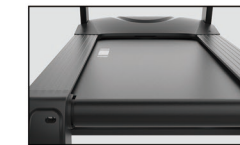
Enhanced User Protection