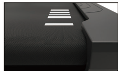
2.3mm thick diamond patterned running strap for more comfortable running