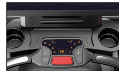
A-Zone controls allow runners make quick and easy choices