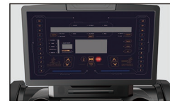
Intuitive LED button touch screen with one click speed and tilt buttons