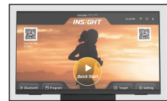
Immersive Smart Experience