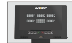
Immersive Training Experience