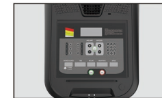
Intuitive LED button touch screen with one click speed and tilt buttons