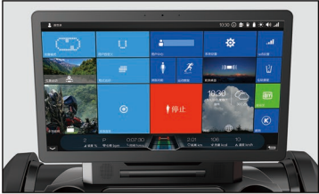
Intuitive LCD capacitive touch screen with one touch speed and tilt buttons