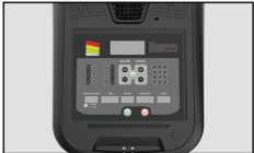
Intuitive LED button touch screen with one click speed and tilt buttons