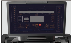
Intuitive LED button touch screen with one click speed and tilt buttons