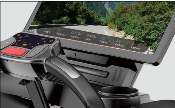
A-Zone controls allow runners make quick and easy choices