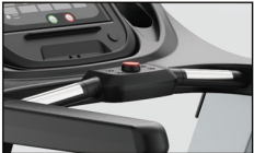
A-Zone controls allow runners make quick and easy choices