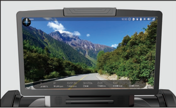
Intuitive LCD capacitive touch screen with one touch speed and tilt buttons