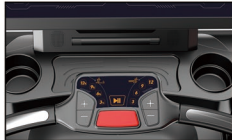
A-Zone controls allow runners make quick and easy choices