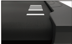
2.3mm thick diamond patterned running strap for more comfortable running