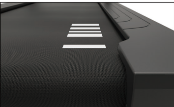
2.3mm thick diamond patterned running strap for more comfortable running