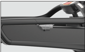
The breathing lights under the armrests are different the he color indicates the status of the treadmill