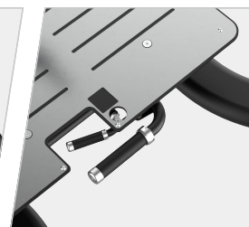
6-Position Adjustable Footplate