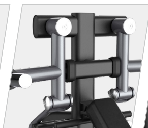
Dual-Pivot Axis Mechanism