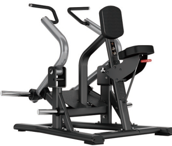
SH005 SEATED ROW