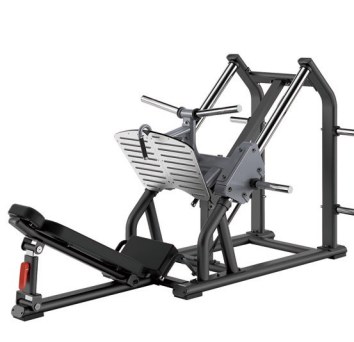
SH019 LINEAR LEG PRESS 45°

Dimension 1450*970*1220mm Total Weight 95kg