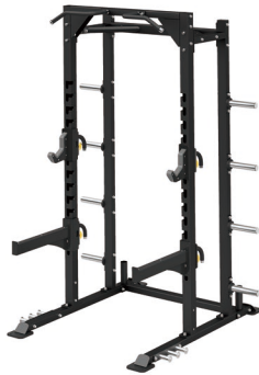
SH010 HALF RACK

Dimension 2227*1496*1250mm Total Weight 227kg