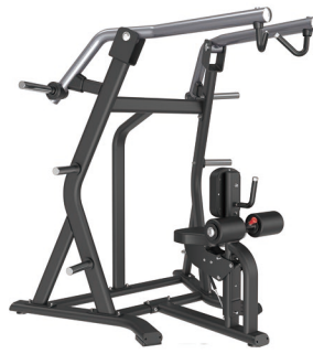
SH027 HIGH ROW

Dimension 1464*1328*2074mm Total Weight 158kg