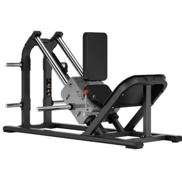
SH009 SEATED HACK SQUAT

Dimension 2227*1496*1250mm Total Weight 227kg