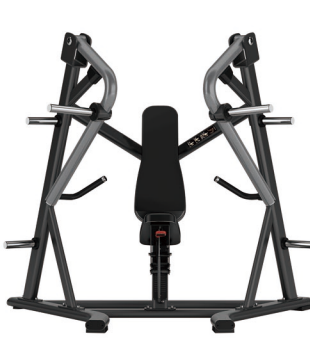
SH012 DECLINE PRESS

Dimension 792*649*1204mm Total Weight 35kg