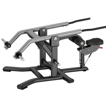
SH016 SEATED DIPS PRESS

Dimension 1500*760*1010mm Total Weight 65kg