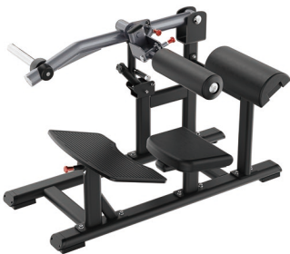
SH031 HIP THRUSTER

Dimension 1670*1335*2037mm Total Weight 161kg