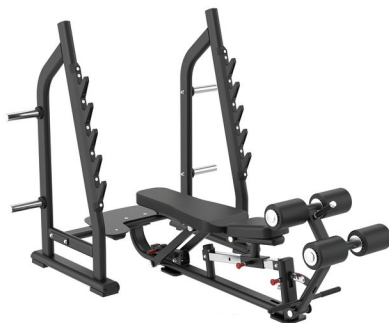
SH048 MULTIT OLYMPIC BENCH

Dimension 1200*1160*1435mm Total Weight 95kg