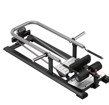
SH023 MULTI BULGARIAN SQUAT

Dimension 1680*1680*1604mm Total Weight 162kg