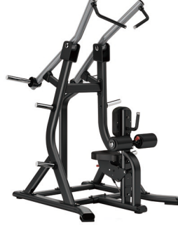
SH026 FRONT PULLDOWN

Dimension 1220*1140*1635mm Total Weight 128kg