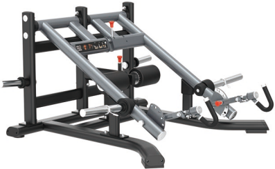
SH058 ISO-LATERAL MULTI-SQUAT LUNGE

Dimension 2142*1625*1632mm Total Weight 225kg