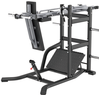
SH033 PENDULUM SQUAT

Dimension 1650*1265*980mm Total Weight 108kg