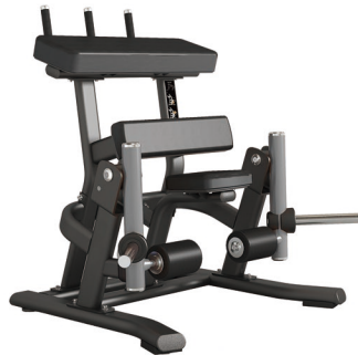
SH014 ALTERNATE LEG CURL

Dimension 2038*1205*480mm Total Weight 112kg