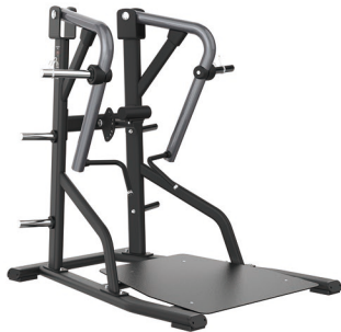
SH060 ISO BENT-OVER ROW

Dimension 1717*1737*1107mm Total Weight 161kg