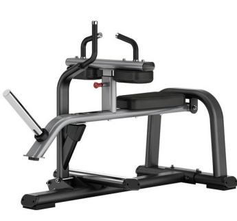
SH015 SEATED CALF RAISE

Dimension 1500*1110*1300mm Total Weight 125kg