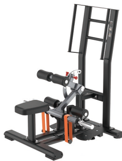
SH046 STANDING HIP THRUST

Dimension 1906*1713*960mm Total Weight 108kg