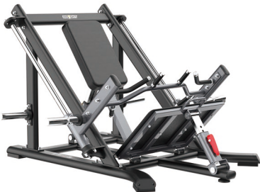
SH059 SMITH ROW

Dimension 1471*1663*847mm Total Weight 123kg