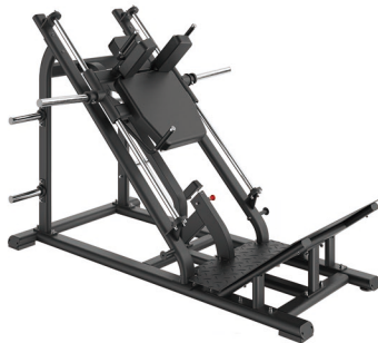
SH036 HACK SQUAT

Dimension 1740*1600*1525mm Total Weight 130kg