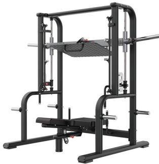
SH043 VERTICAL LEG PRESS

Dimension 1985*1476*1890mm Total Weight 235kg