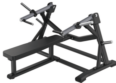
SH045 HORIZONTAL BENCH PRESS

Dimension 1561*1518*2006mm Total Weight 124kg