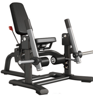
SH017 ALTERNATE LEG EXTENSION

Dimension 1850*1400*940mm Total Weight 125kg