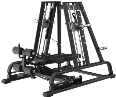
SH057 DECLINE/FLAT SMITH PRESS

Dimension 1773*1887*2106mm Total Weight 230kg