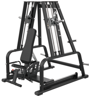
SH056 INCLINE/SHOULDER SMITH PRESS

Dimension 1773*1887*2106mm Total Weight 230kg