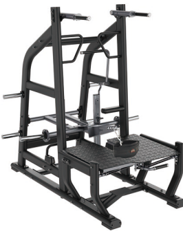
SH039 MULTI BELT SQUAT

Dimension 2025*1870*1610mm Total Weight 174kg