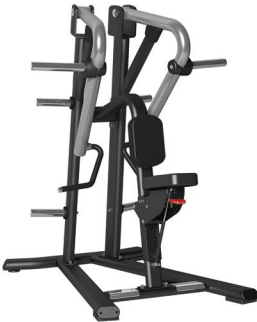
SH004 LOW ROW