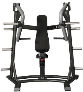
SH001 CHEST PRESS

The Insight SH Series of plate-loaded equipment features a sleek design with a premium matte black finish. With nearly 40 machines targeting specific muscle groups, it offers a diverse selection and an impressive "forest of equipment" effect. Designed by anatomy experts and professional athletes, the equipment meets the demands of competitive training. Structurally designed to minimize joint stress, it ensures safe and durable use.