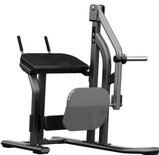
SH007 REAR KICK