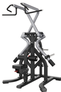
SH037 LAT PULLDOWN CIRCULAR

Dimension 2225*1786*1578mm Total Weight 244kg