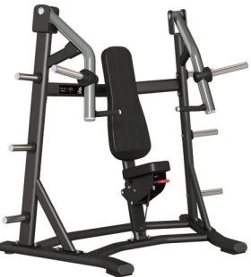
SH002 INCLINE CHEST PRESS