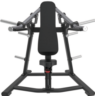
SH003 SHOULDER PRESS