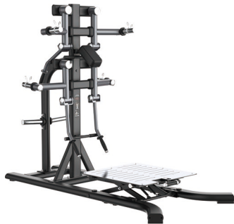
SH034 STANDING MULTI FLIGHT

Dimension 1670*750*1456mm Total Weight 110kg