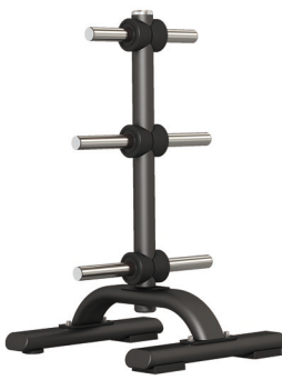
SH011 WEIGHT PLATE TREE

Dimension 1750*1620*2450mm Total Weight 153kg