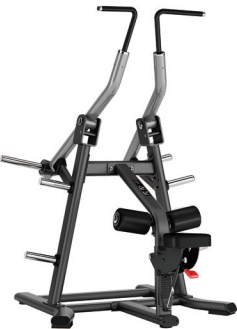
SH006 LAT PULLDOWN