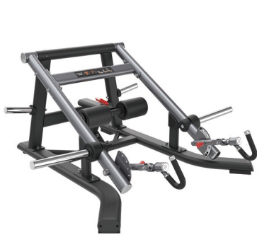
SH028 MULTI DEADLIFT

Dimension 1670*1597*835mm Total Weight 101kg