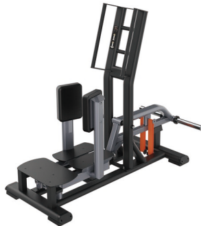
SH044 STANDING ABDUCTOR

Dimension 1435*2415*1925mm Total Weight 200kg