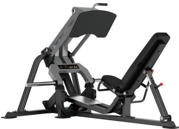
SH008 V LEG PRESS