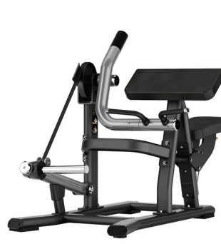
SH018 BICEPS CURL

Dimension 2043*1271*1790mm Total Weight 150kg