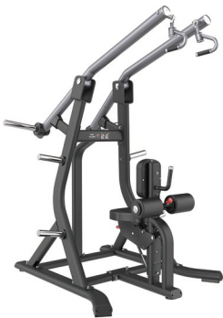
SH029 UNIVERSAL PULLDOWN

Dimension 1670*1597*835mm Total Weight 101kg