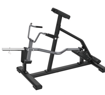
SH024 T-BAR ROW

Dimension 1600*1600*1260mm Total Weight 110kg