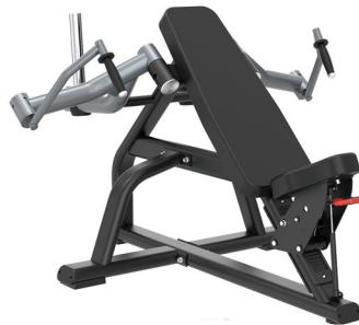
SH049 CHEST FLY

Dimension 1965*1635*1570mm Total Weight 150kg