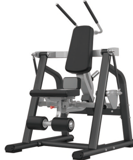
SH025 UNIVERSAL ABDOMINALS CRUNCH

Dimension 1920*995*1260mm Total Weight 78kg