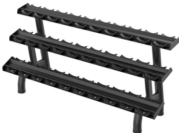
RE6027 DUMBBELL RACK

Dimension 1666*740*890mm Total Weight 48kg