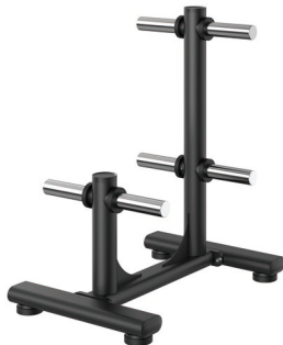
RE6021 WEIGHT PLATE TREE

Dimension 1276*786*940mm Total Weight 90kg