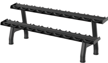
RE6012 DUMBBELL RACK