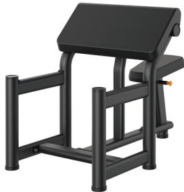
RE6020 PREACHER BENCH

Dimension 1366*746*440mm Total Weight 44kg