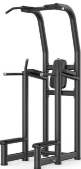
RE6008 MUTLI PULL UP/DIP RACK