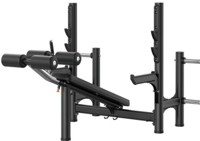
RE6006 DECLINE OLYMPIC BENCH