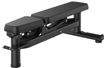
RE6016 ADJUSTABLE BENCH

Dimension 1366*746*440mm Total Weight 44kg