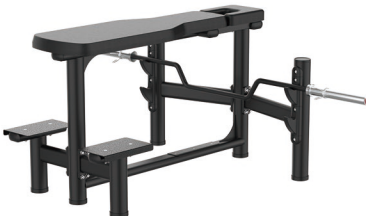
RE6042+RE6042OPT SEAL ROW BENCH

Dimension 1386*584*778mm Total Weight 60kg