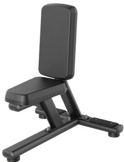
RE6024 FIXED UPRIGHT BENCH

Dimension 776*547*907mm Total Weight 24kg