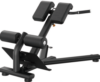
RE6010 BACK EXTENSION