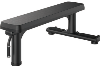
RE6014 FLAT BENCH