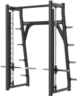
RE6001 SMITH MACHINE

The Insight RE60 Free Weight Series features a stylish and refined design, reflecting a high-end aesthetic. Built with heavy-duty commercial-grade materials and innovative safety structures, it ensures secure usage for members in commercial clubs and personal Tailtraining studios.