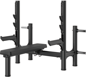
RE6004 FLAT OLYMPIC BENCH