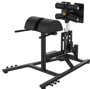
RE6032 GLUTE/HAM DEVELOPER BENCH

Dimension 809*746*928mm Total Weight 24kg