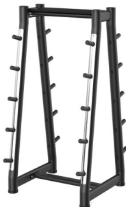
RE6031 BARBELL RACK

Dimension 2250*1150*2460mm Total Weight 211kg