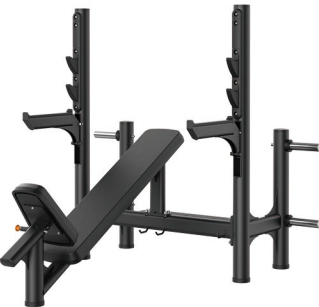
RE6005 INCLINE OLYMPIC BENCH