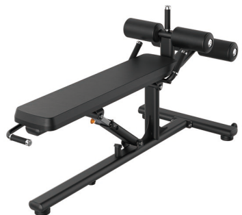
RE6025 MULTI AB BENCH

Dimension 2200*1577*920mm Total Weight 114kg