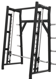
RE6030 7° ANGLED SMITH MACHINE

Dimension 2260*630*1050mm Total Weight 121kg