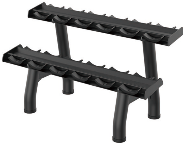
RE6036 DUMBBELL RACK

Dimension 1757*1303*1335mm Total Weight 129kg