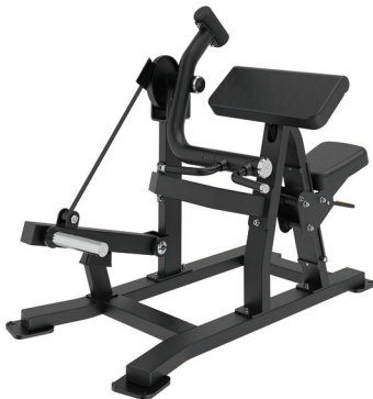
FH018 BICEPS CURL

Dimension 1473*1004*1232mm Total Weight 95kg