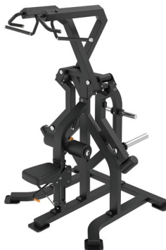
FH037 LAT PULLDOWN CIRCULAR

Dimension 1697*1386*2013mm Total Weight 161kg