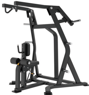
FH027 HIGH ROW

Dimension 1514*1386*2061mm Total Weight 158kg