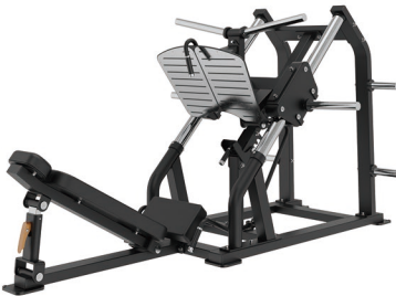
FH019 LINEAR LEG PRESS 45°

Dimension 1473*1004*1232mm Total Weight 95kg