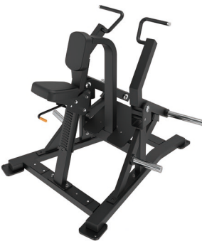
FH005 SEATED ROW Dimension 1494*1259*1251mm Total Weight 124kg