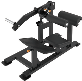
FH031 HIP THRUSTER

Dimension 1134*1131*1623mm Total Weight 128kg