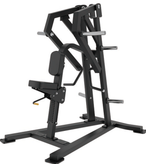
FH004 LOW ROW Dimension 1633*1171*1689mm Total Weight 131kg