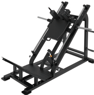
FH036 HACK SQUAT

Dimension 1727*1700*1505mm Total Weight 130kg