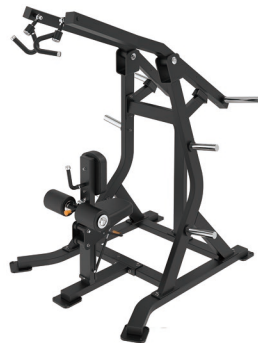
FH029 UNIVERSAL PULLDOWN

Dimension 1723*1521*767mm Total Weight 101kg