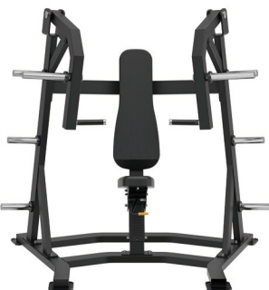
FH002 INCLINE CHEST PRESS Dimension 1864*1217*1768mm Total Weight 136kg