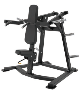
FH003 SHOULDER PRESS Dimension 1591*1526*1503mm Total Weight 130kg