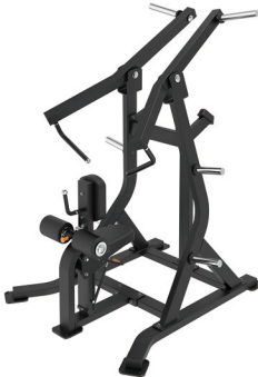
FH026 FRONT PULLDOWN

Dimension 2265*1774*1566mm Total Weight 244kg