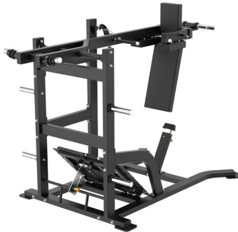
FH033 PENDULUM SQUAT

Dimension 1651*1269*916mm Total Weight 108kg