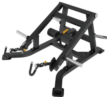
FH028 MULTI DEADLIFT

Dimension 1514*1386*2061mm Total Weight 169kg