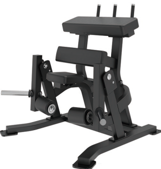
FH014 ALTERNATE LEG CURL Dimension 1482*1219*1286mm Total Weight 125kg