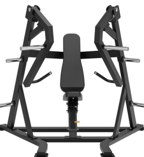
FH012 DECLINE PRESS Dimension 2129*1493*1752mm Total Weight 150kg