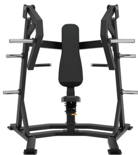
FH001 CHEST PRESS Dimension 1870*1194*1748mm Total Weight 137kg

The Insight FH Series of plate-loaded equipment is a robust and powerful line that evolves from the SH series, featuring square tubing for a distinctively tough aesthetic. With 21 different machines, this series fully accommodates the comprehensive training needs of advanced users. It is the preferred choice for iron gym-style fitness centers and advanced trainers, offering a specialized range that meets every aspect of sophisticated training demands.