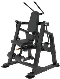
FH025 UNIVERSAL ABDOMINALS CRUNCH

Dimension 1648*1628*1567mm Total Weight 162kg