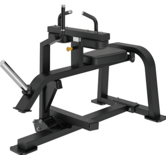
FH015 SEATED CALF RAISE Dimension 1516*789*1011mm Total Weight 65kg