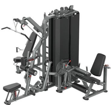
BS023 3 STACK MULTI-STATION