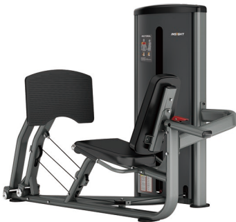
BS015 SEATED LEG PRESS