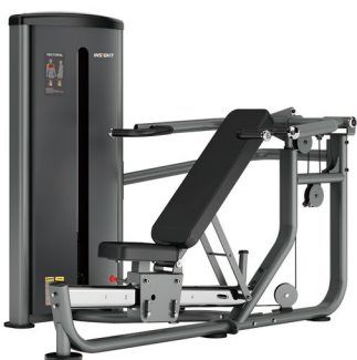
BS009 MULTI PRESS