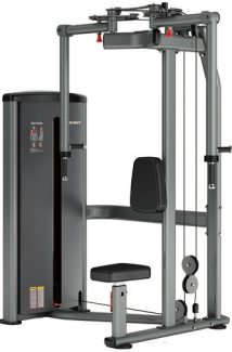
BS011 PEC FLY/REAR DELT