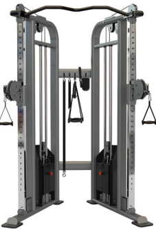
BS017 DUAL ADJUSTABLE PULLEY