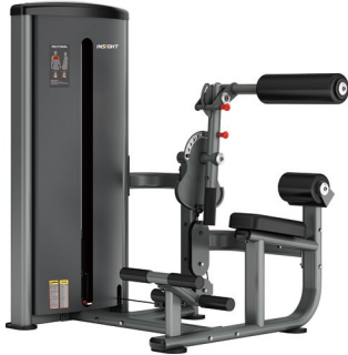
BS013 ABDOMINAL/BACK EXTENSION