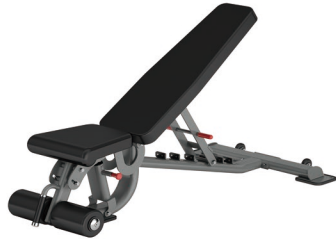
BS020 ADJUSTABLE BENCH