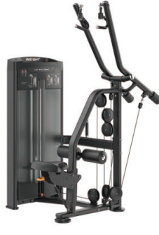
RE8028 LAT PULLDOWN