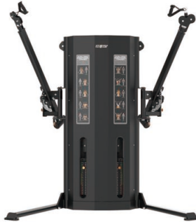
RE8046 DUAL-ARM FUNCTIONAL TRAINER