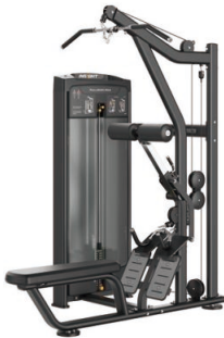
RE8026 LAT PULLDOWN/LOW ROW