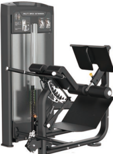
RE8040 MULTI BACK EXTENSION