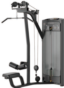
RE8011 DUAL PULLEY LAT PULLDOWN