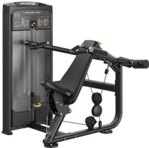
RE8004 SHOULDER PRESS