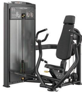
RE8001 CHEST PRESS

The Insight RE80 Selectorized Series, created by top international design team, features premium quality and striking visuals. Engineered for smooth and stable use, it's the result of collaboration among expert engineers, kinesiology specialists, and athletes, ensuring each machine supports natural movement and safe, effective workouts. Tailored for professional training, the RE80 Series brings innovative versatility to selectorized strength equipment.