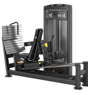
RE8016 LEG PRESS/HACK SQUAT