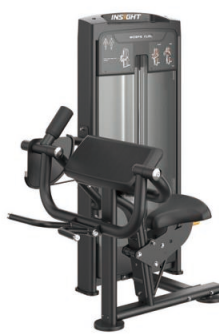
RE8006 BICEPS CURL