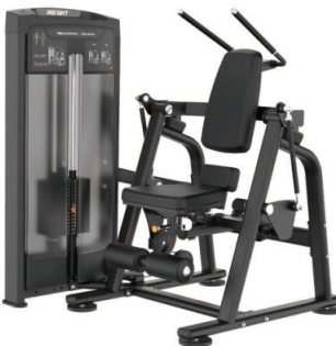
RE8035 ABDOMINAL CRUNCH