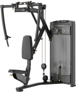
RE8003 PEC FLY/REAR DELT