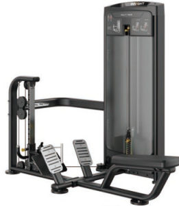
RE8005 MULTI PULLEY ROW