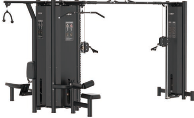
RE8023+RE8024-01+RE80240PT 5 STACK MULTI-STATION