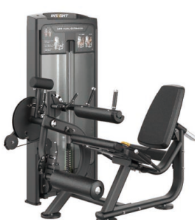
RE8025 LEG CURL/EXTENSION