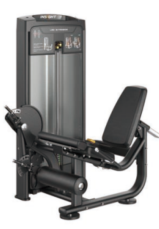
RE8014 LEG EXTENSION