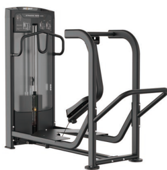
RE8032 STANDING REAR KICK