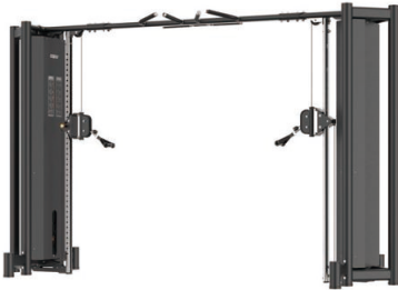
RE8024-01+ RE8024-01+RE80240PT CROSSOVER CABLES