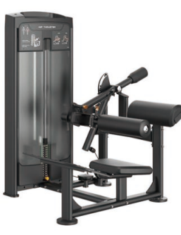
RE8022 HIP THRUSTER