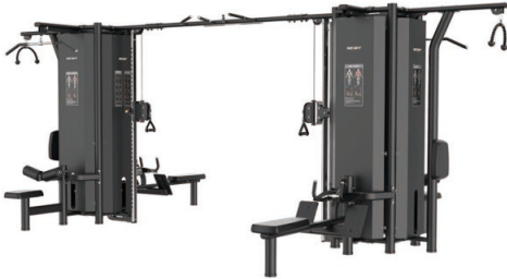
RE8023+RE8023+RE80240PT 8 STACK MULTI-STATION