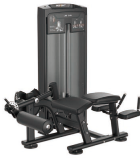
RE8015 LEG CURL