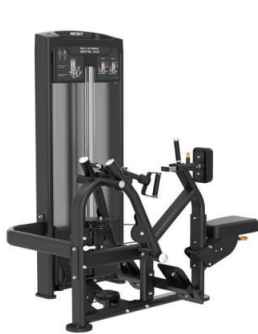
RE8030 ISO-LATERAL SEATED ROW