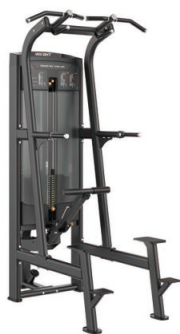
RE8008 ASSISTED CHIN/DIP