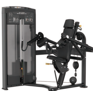
RE8031 ISO-LATERAL SEATED BICEPS CURL