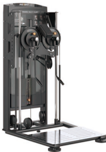
RE8034 STANDING MULTI FLIGHT