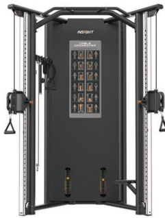
RE8021 DUAL ADJUSTABLE PULLEY