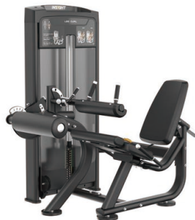
RE8013 LEG CURL