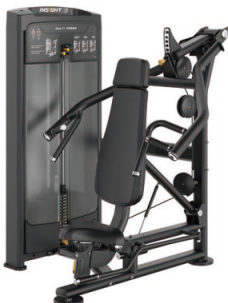
RE8029 MULTI PERSS