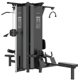
RE8023 4 STACK MULTIT-STATION