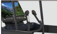
Ergonomic heart rate detection handle with resistance control button