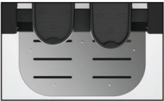
Stainless steel foot pedal platform, convenient for users to get on and off the machine