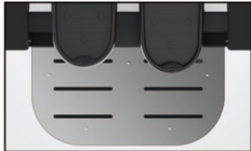
Stainless steel foot pedal platform, convenient for users to get on and off the machine