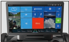
Intuitive LCD capacitive touch screen with one click resistance button