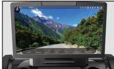
Intuitive LCD capacitive touch screen with one click resistance button