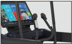
Ergonomic heart rate detection handle with resistance control button