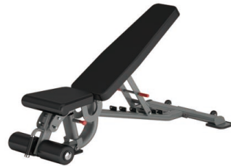
BS020 ADJUSTABLE BENCH