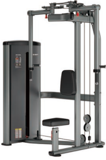
BS011 PEC FLY/REAR DELT