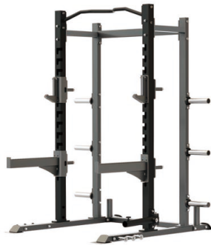
BS018 HALF RACK