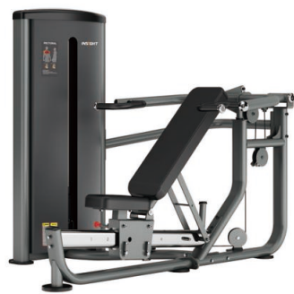
BS009 MULTI PRESS

The Insight BS Series multi-functional selectorized machines are versatile, maximizing space efficiency for flexible training area arrangement. Built to commercial-grade standards with robust materials,they promise durability for high-intensity use.