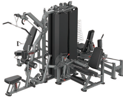
BS023+BS023LP 4 STACK MULTI-STATION