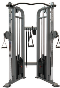
BS017 DUAL ADJUSTABLE PULLEY