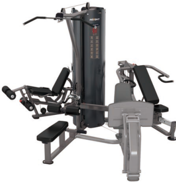
BS004+BS004LP 4 STACK MULTI-STATION