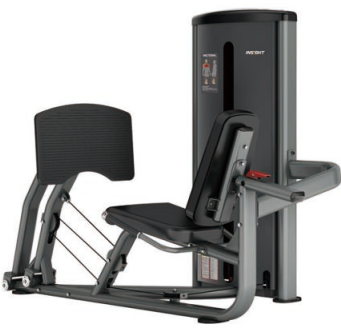
BS015 SEATED LEG PRESS