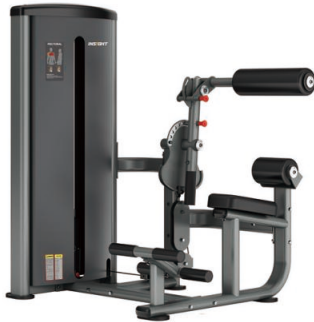
BS013 ABDOMINAL/BACK EXTENSION