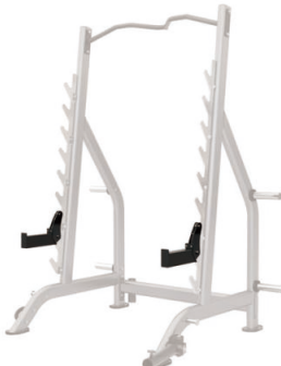
BS019-OPTSR SAFETY RACKS (OPTIONAL)