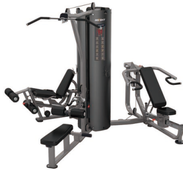
BS004 3 STACK MULTI-STATION