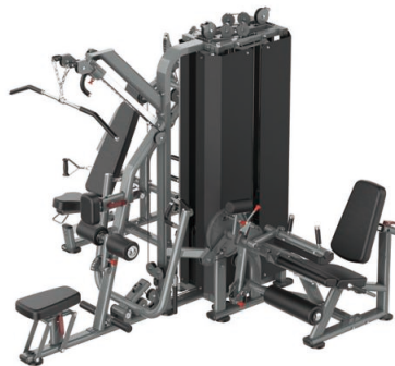
BS023 3 STACK MULTI-STATION