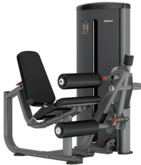
BS008 LEG CURL/EXTENSION