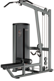
BS010 LAT PULLDOWN/LOE ROW